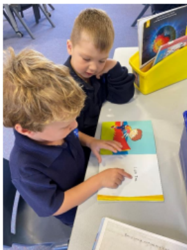
Moody Street, Koo Wee Rup 3981 Website: www.kooweerups.vic.edu.au

To arrange your personal tour, please contact the school on 5997 1272.