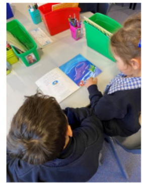
Phone: 5997 1272 Email: koo.wee.rup.ps@education.vic.gov.au